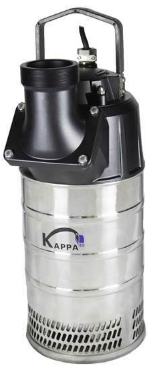
Attention: pictures for illustrative purposes

Installation: Vertical Floating on board machine: not present